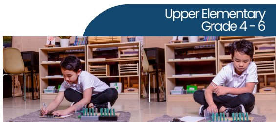
Upper Elementary Grade 4 – 6