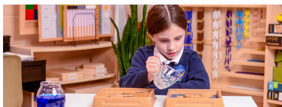
Lower Elementary Grade 1 – 3